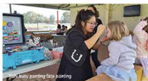
Yishi busy painting face painting