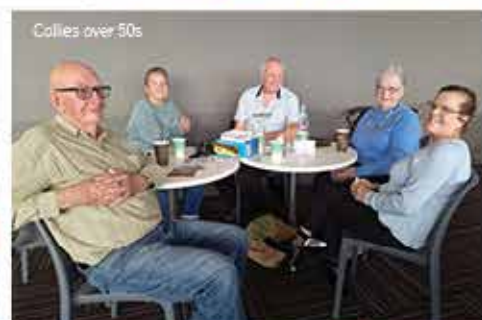
Colliers over 50s