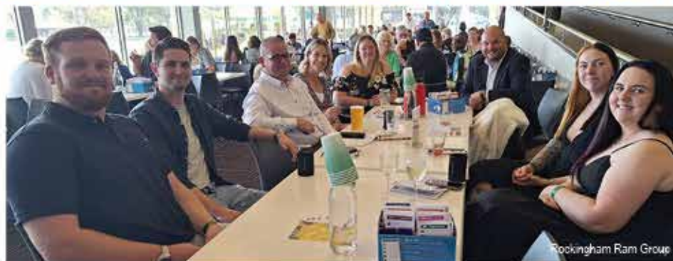
Rockingham Ram Group