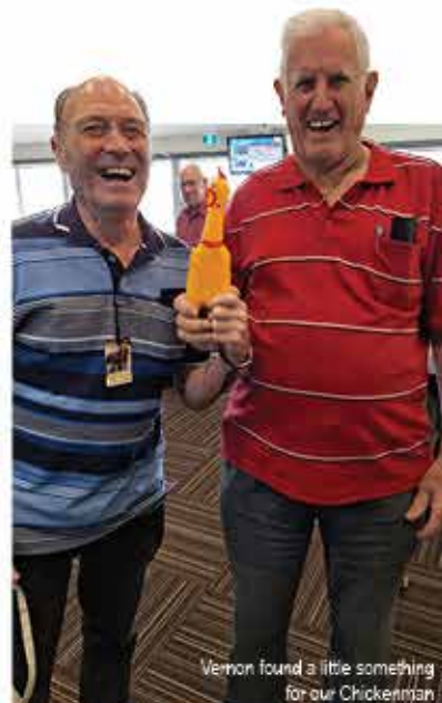
Vernon found a little something for our Chickenman