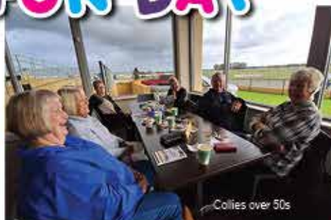
Colliers over 50s