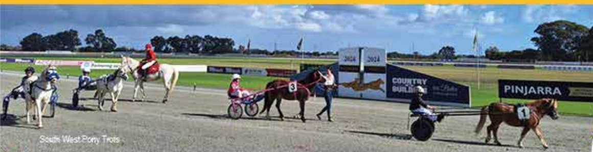
South West Pony Trots