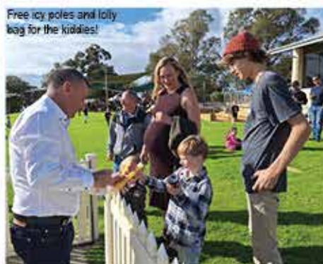
Free icy poles and lolly bag for the kiddies!