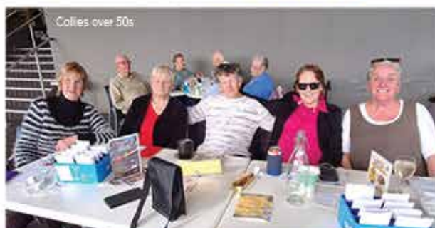
Colliers over 50s